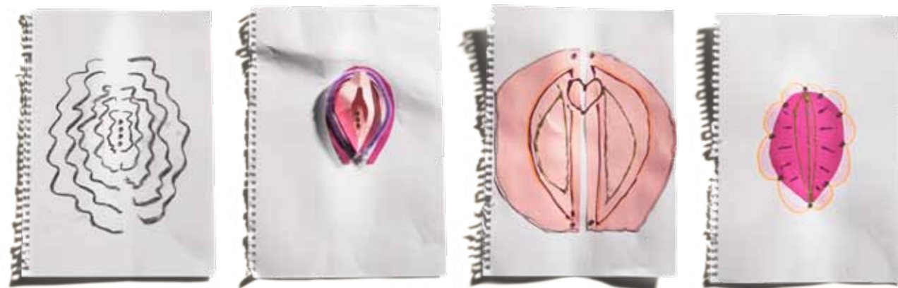
A STUDY FROM THE UNIVERSITY OF GRONINGEN, THE NETHERLANDS.

One visit to Spotlight. Two hours. Thirteen giggling staffers. Below, some examples of what we came up with.